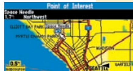
Screen shown with MapSource™ City Navigator data

Use the "find" feature to select an attraction or point of interest**