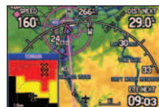
Pop-up Terrain Alert display