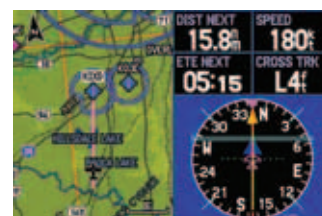
Map screen (with HSI)